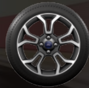
17" Painted Machined Aluminum Standard