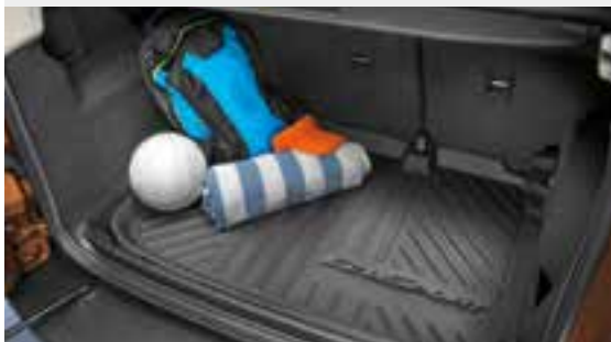
Cargo area protector

Titanium in Ruby Red Metallic Tinted Clearcoat accessorized with hood deflector, side window deflectors, 1 front and rear molded splash guards, keyless entry keypad, roof crossbars, 1 roof-mounted bike carrier, 1,2 and wheel lock kit