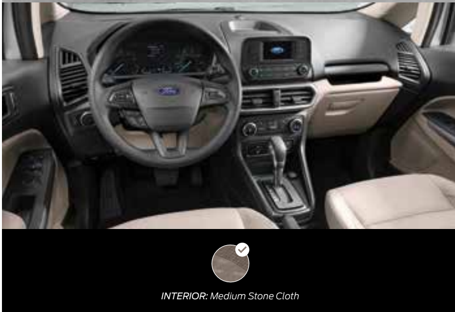
INTERIOR: Medium Stone Cloth