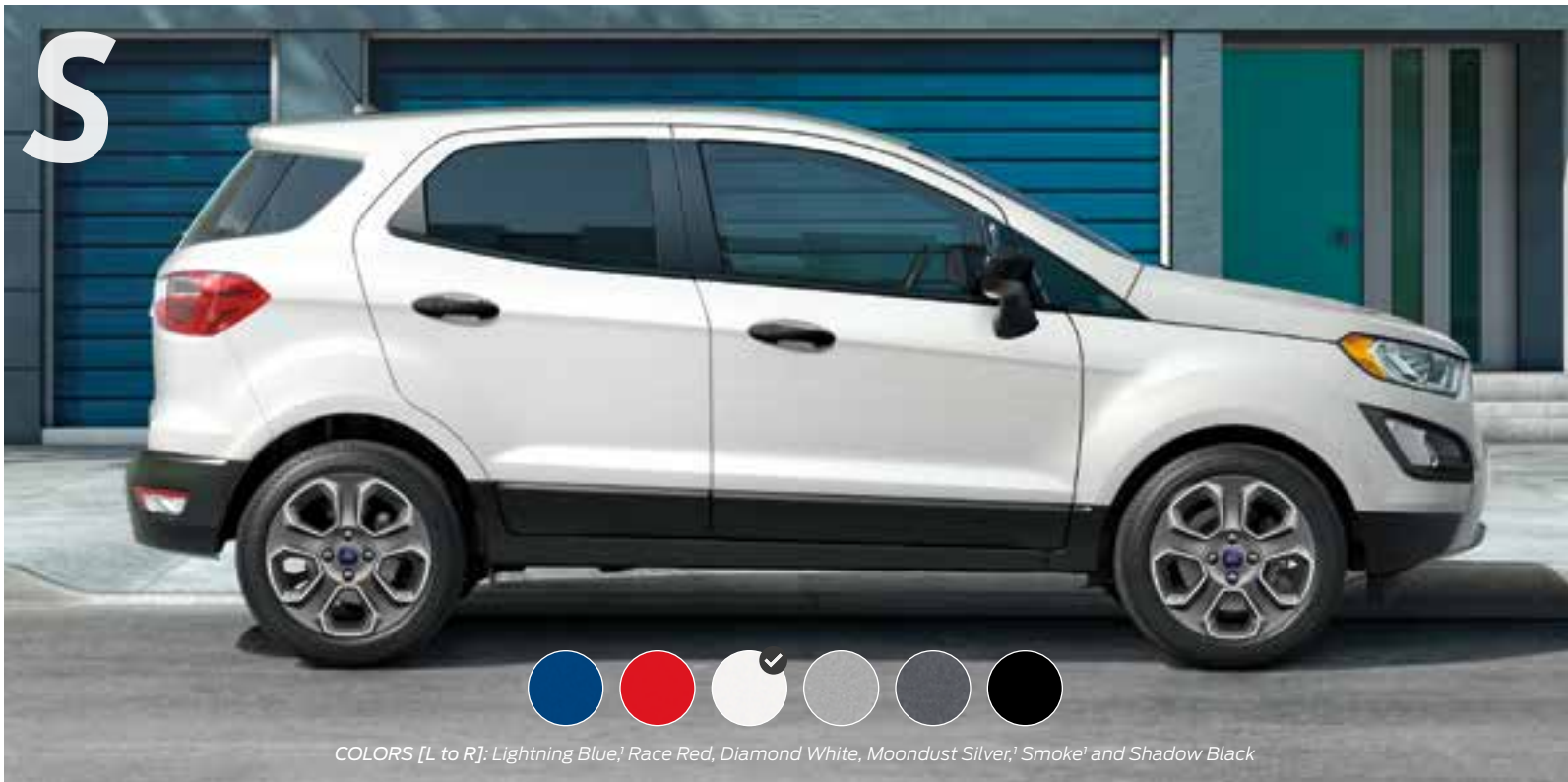
COLORS [L to R]: Lightning Blue, 1 Race Red, Diamond White, Moondust Silver, 1 Smoke 1 and Shadow Black