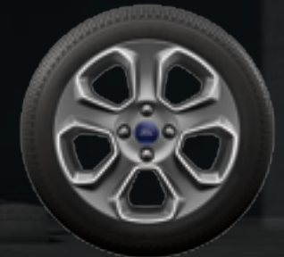
16" Low-Gloss Magnetic-Painted Machined-Face Aluminum Standard