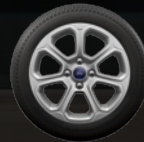
16" Shadow Silver-Painted Aluminum Standard