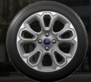
17" Premium Dark Stainless-Painted Machined Aluminum Standard