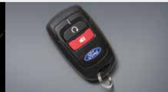
Remote start systems

Shop the complete collection at accessories.ford.com